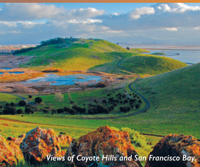
Views of Coyote Hills and San Francisco Bay.