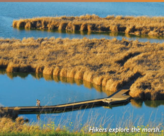
Hikers explore the marsh.