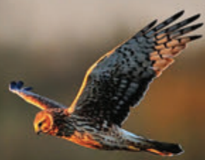
A hunting northern harrier.